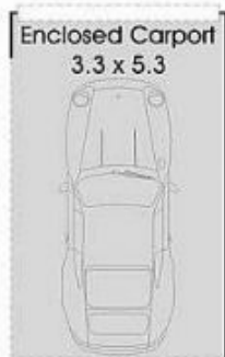
NOT IN PLACE