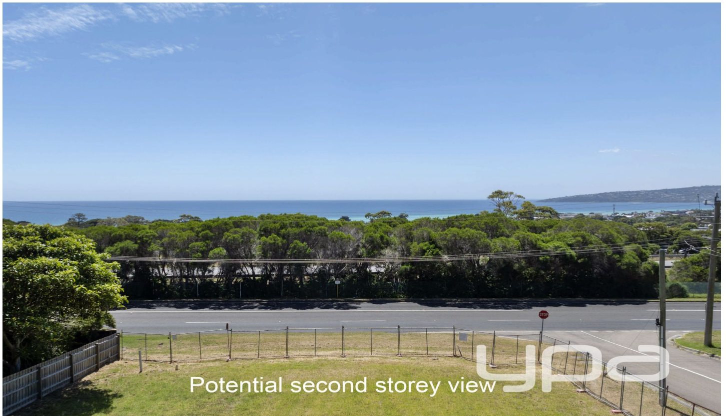
Potential second storey view