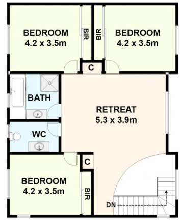
14 Clifton Street, Aberfeldie. All data and dimensions shown in this sketch are approximate.