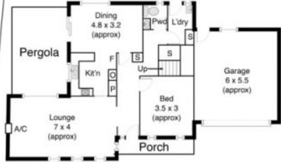
All Dimensions are approximate