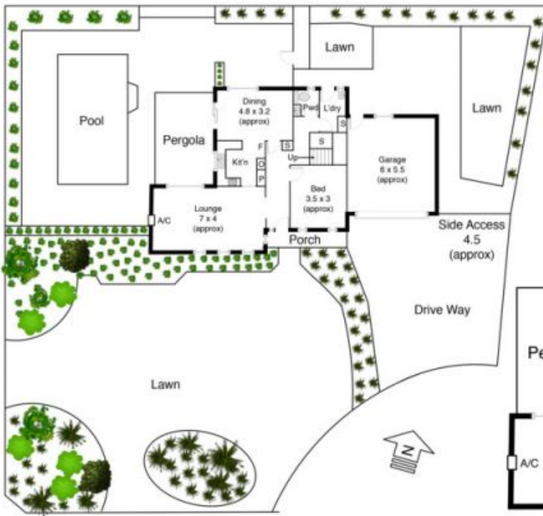
1 Odette Place Melton West