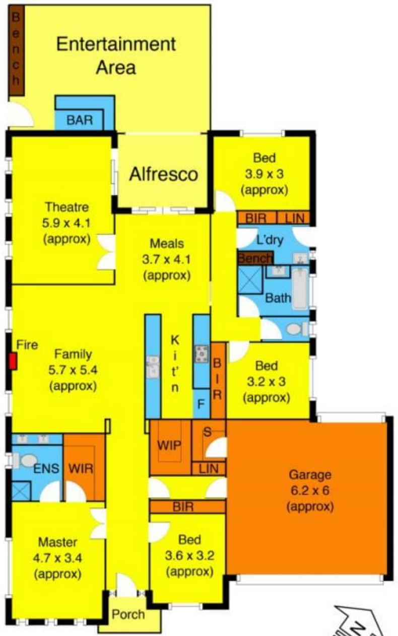
Desert Gum Way