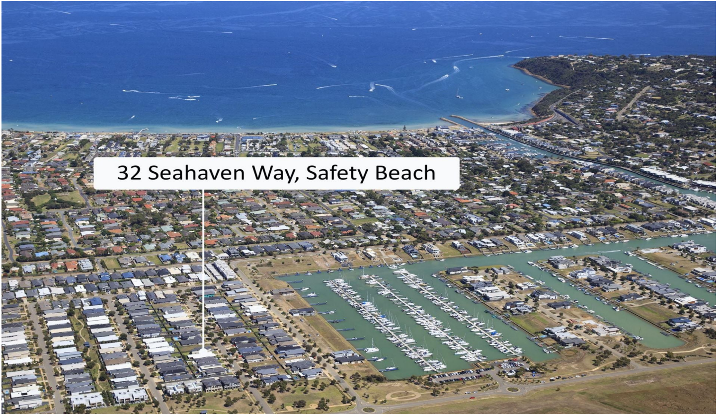
32 Seahaven Way, Safety Beach