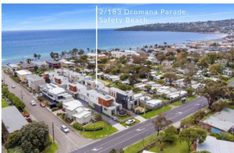
2/183 Dromana Parade, Safety Beach