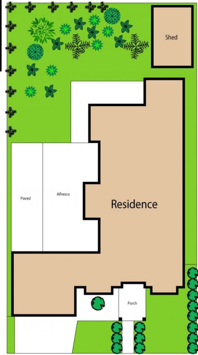
Site Plan (Not to scale)