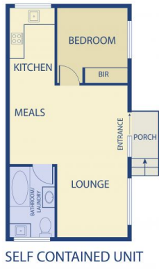
SELF CONTAINED UNIT