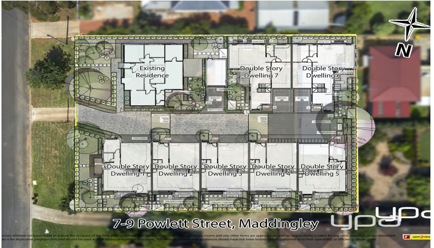
7-9 Powlett Street, Maddingley

Every attempt has been made to ensure the accuracy of the floor plan contained here. Measurements of doors, windows, rooms and any other items are approximate and no responsibility is taken for any error, omission, or mis-statement. This plan is for illustrative purposes only and should be used as such by any prospective purchaser. The services, systems and appliances shown have not been tested and no guarantee as to their operability or efficiency can be given.