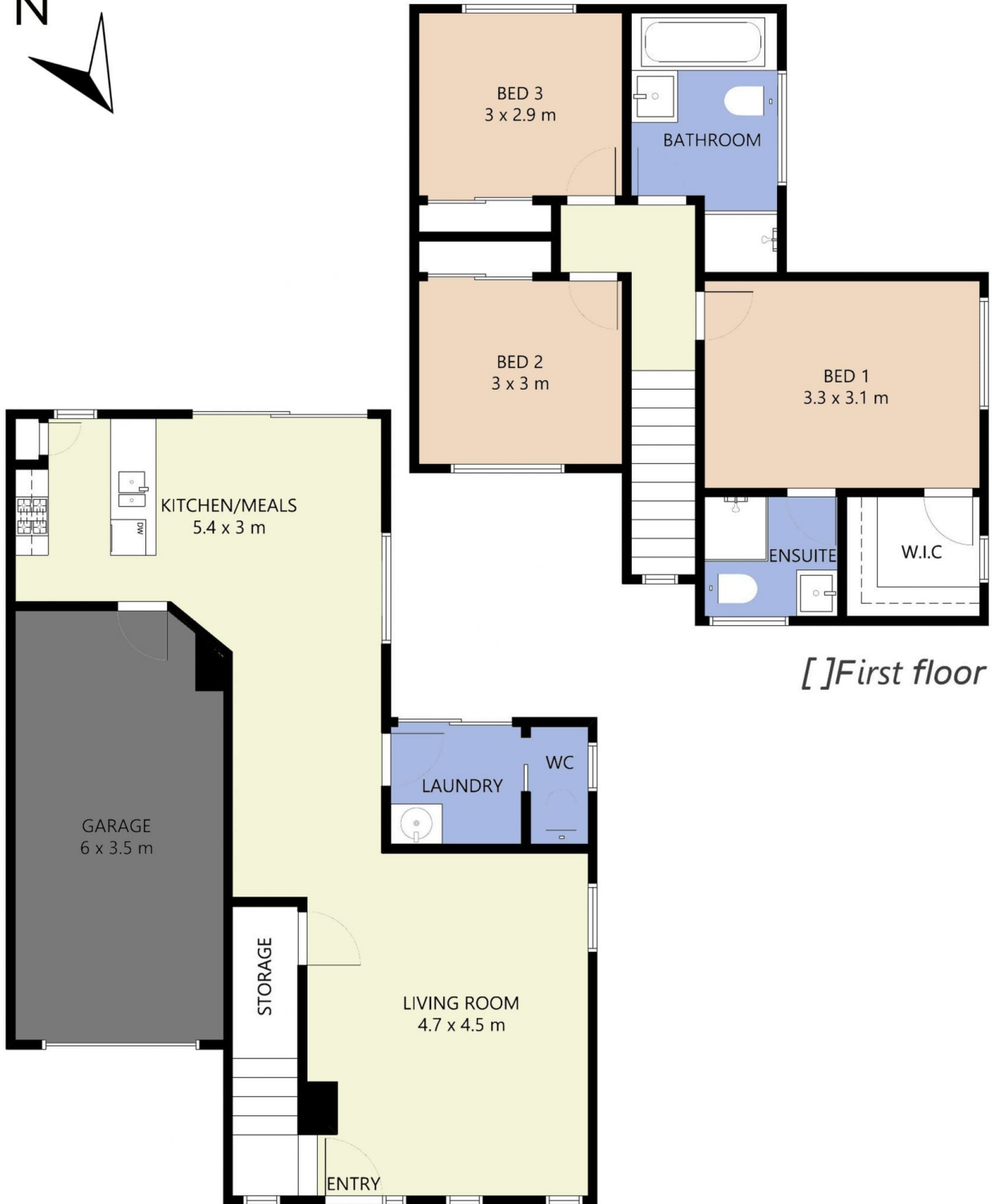
[ ] First floor